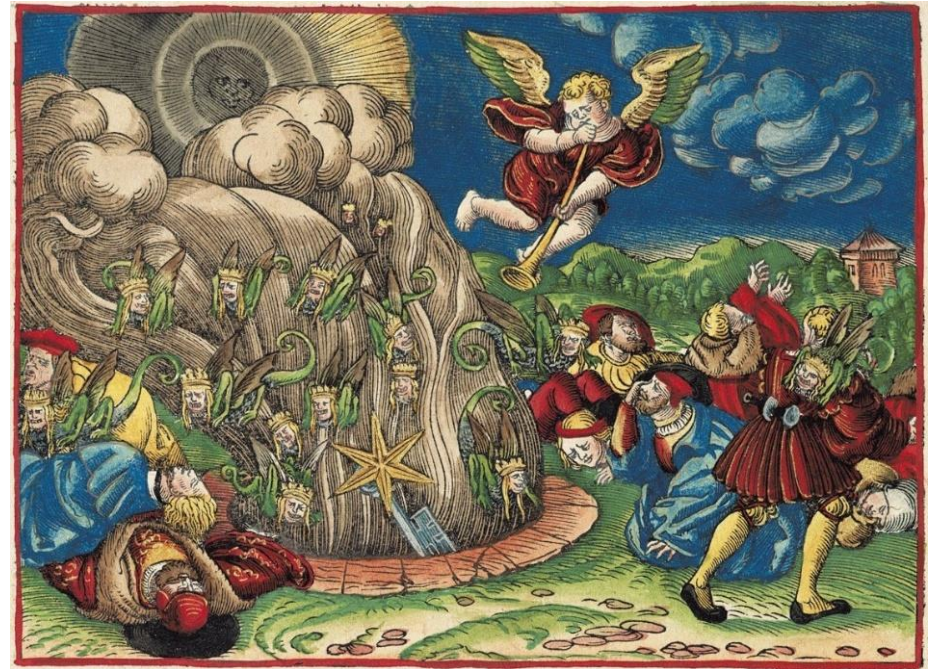
The Luther Bible 1534: Revelation 9:1-12 – The 5 th Angel with the Key to the Bottomless Pit, #962

O LORD JESUS, Who hast done all things well, Who makest both. the deaf to hear and the dumb to speak: I beseech Thee, lay Thy hands upon our pastor, loose the string of his tongue, that he may speak plainly; open the deaf ears of Thy people, that they may hear the words which belong unto eternal life; Who livest and reignest with the Father and the Holy Ghost, ever one God, world without end. Amen. (Oremus, 1925, p.138, adapted for lay use).