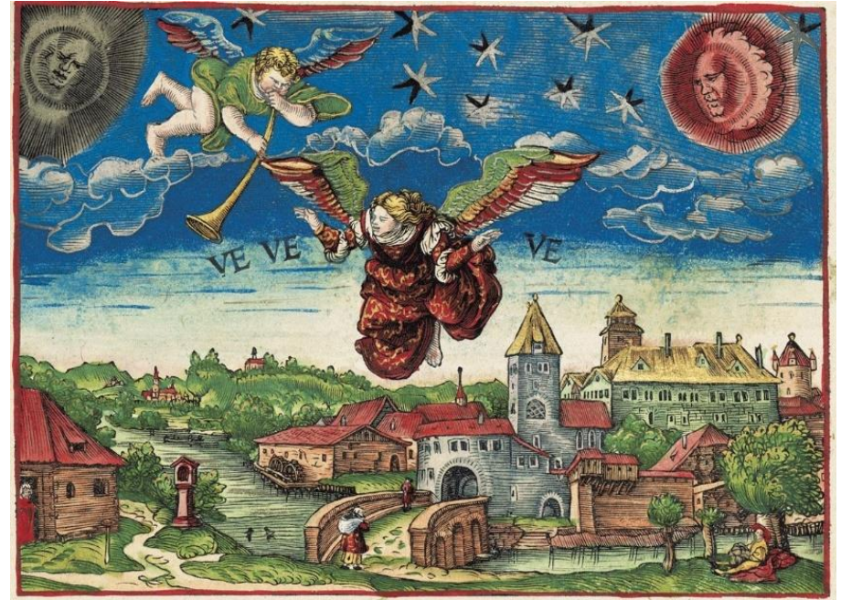
The Luther Bible 1534: Revelation 8:12-13 – The 4 th Angel Saying “Woe, woe, woe.” #961

GOD, Who hast sounded into our ears Thy divine and salutary oracles; Illuminate the souls of us sinners to the comprehension of that which has been read, so that we may not only be seen to be hearers of spiritual things, but doers of good works, following after faith without guile, blameless life, conversation without charge of guilt; in Christ Jesus our Lord, with Whom Thou art blessed, with Thy most Holy and Good and Quickening Spirit, now and ever and to ages of ages. Amen. (Oremus, 1925, p.137).