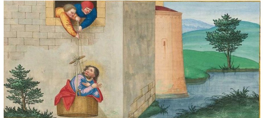
Ottheinrich Bible 1430 (V:48) St. Paul Let Down in Basket

Those who are not yet invited to receive the Sacrament are encouraged to meditate on God's Word in the distribution hymns and pray for the day when our divisions will have ceased.