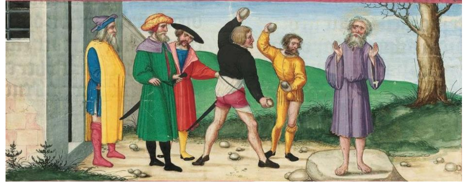
Otttheinrich Bible 1430 (V:47) St. Paul Being Stoned https://daten.digitale-sammlungen.de/~db/0002/bsb00021200/images/

Those who are not yet invited to receive the Sacrament are encouraged to meditate on God's Word in the distribution hymns and pray for the day when our divisions will have ceased.