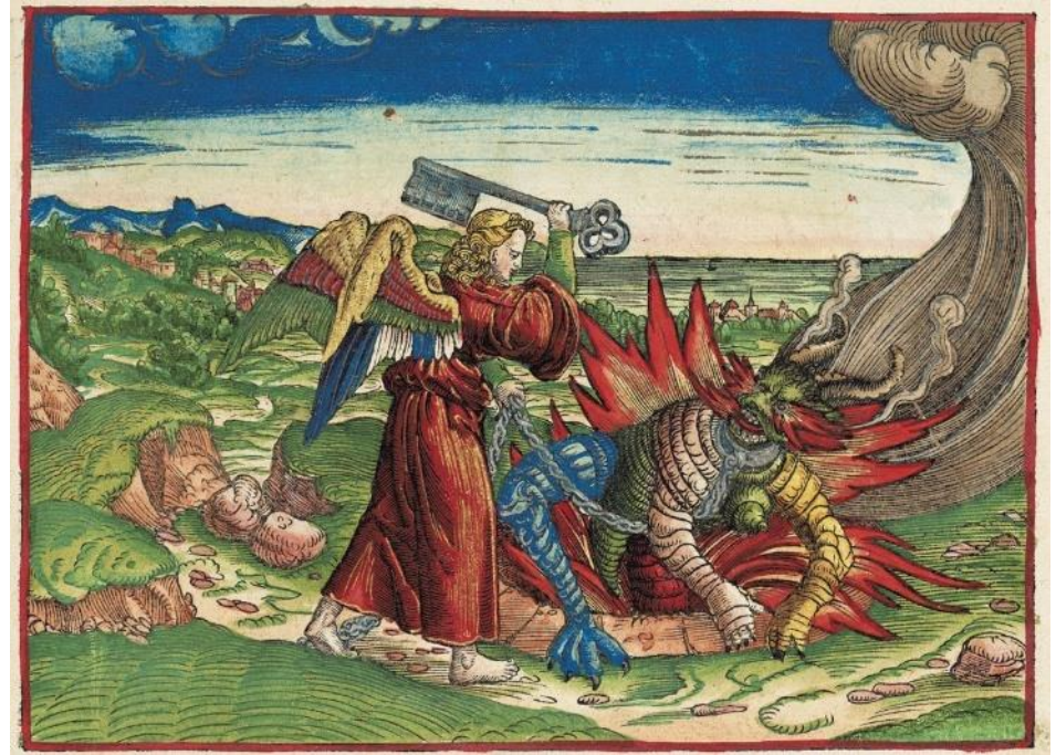
The Luther Bible 1534: Revelation 20:1-3 – The Angel with the Key, #979

Those who are not yet invited to receive the Sacrament are encouraged to meditate on God's Word in the distribution hymns and pray for the day when our divisions will have ceased.