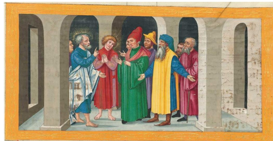
Ottheinrich Bible 1430 (VI:64) Peter and John in the Temple

Those who are not yet invited to receive the Sacrament are encouraged to meditate on God's Word in the distribution hymns and pray for the day when our divisions will have ceased.