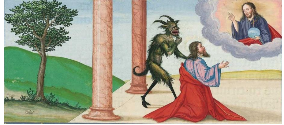
Ottheinrich Bible 1430 (V:48) St. Paul's Thorn in the Flesh

I pray that the hand of the truth may be stretched out and blessing given to this people on account of Thy lovingkindness, O God of compassion: May a hand of piety and power and sound discipline and cleanness and all holiness, bless this people, and continually preserve it to advancement and improvement, through Thy Only-Begotten Jesus Christ in the Holy Spirit. Amen. (Oremus, 1925, p.151-152).