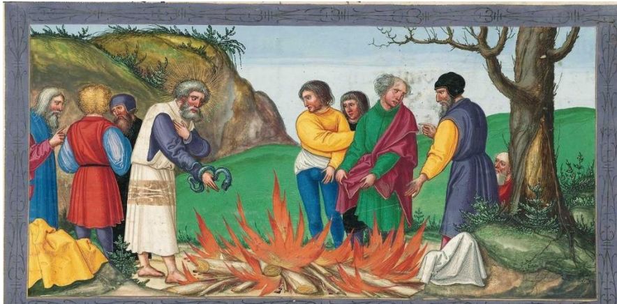
Ottheinrich Bible 1430 (VII:50a)

The Snake Attacks to Paul without Effect in Acts 28:1-6