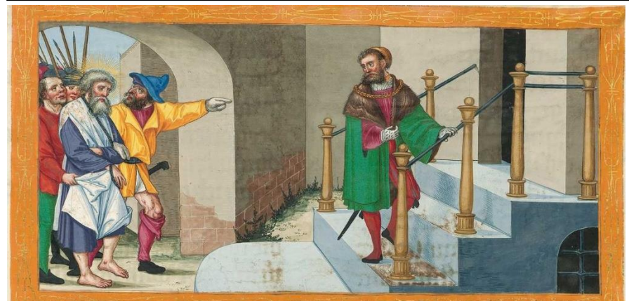
Ottheinrich Bible 1430 (VII:34) Paul Addresses Crowd in Jerusalem in Acts 21:37-22:21

COUNT us worthy of this communion also, O God of Truth, and make our bodies to contain purity and our souls prudence and knowledge; and make us wise, O God of Compassions, by the participation of the body and blood, because through Thy Only-Begotten to Thee is glory and strength in the Holy Spirit, now and to all the ages of the ages. Amen. (Oremus, 1925, p.141).