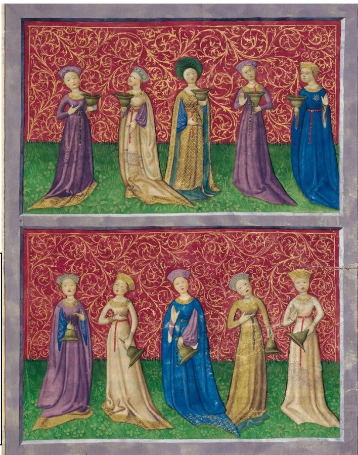
Ottheinrich Bible 1430 (I:76) The Ten Virgins in Matthew 25:1-13

We thank Thee, Lord God, Heavenly Father, that in the past Church Year Thou hast preserved Thy Word among us in purity and by it effectively enlivened our souls; and we beseech Thee, that Thou wouldst graciously forgive us all our neglect, unbelief, and disobedience with respect to Thy Word, and continue to give us this precious treasure with Thy blessing forevermore; through Jesus Christ, Thy Son, our Lord, Who liveth and reigneth with Thee and the Holy Ghost, ever one God, world without end. Amen.