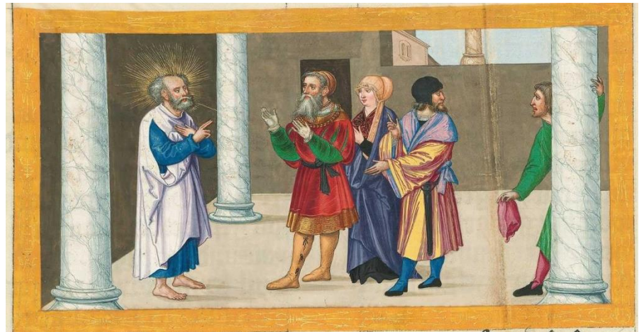
Ottheinrich Bible 1430 (VII:5)

I BELIEVE in Thee, O God, the Father, my Maker; I believe in Thee, O God, the Son, my Savior; I believe in Thee, O God, the Holy Ghost, my Helper. Glory be to Thee O Holy Trinity. Amen. (Oremus, 1925, p.126).