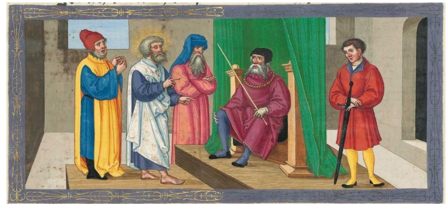
Ottheinrich Bible 1430 (VII:41)

GLORY be to Thee, O Lord Jesus Christ! Welcome to my soul, Lord Jesus, with the precious drink of Thy most holy blood, which, with the consecrated wine, Thou givest me to drink in Thy sacrament, as Thou didst pour it out on the cross for the forgiveness of my sins. May this bless me into everlasting life. Amen. (Oremus, 1925, p.148).