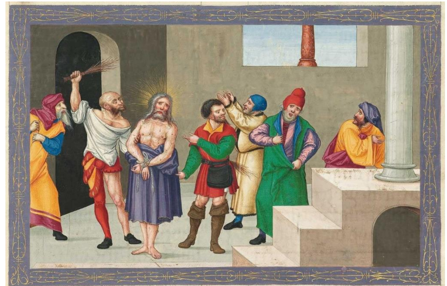
Ottheinrich Bible 1430 (VII:20)

GIVE me again, Lord, the robe of immortality which I lost by the sin of the first parents, and although I am unworthy to come unto Thy holy sacrament, grant that I may attain everlasting joy; Who livest and reignest with the Father and the Holy Ghost, ever one God, world without end. Amen. (Oremus, 1925, p.131).