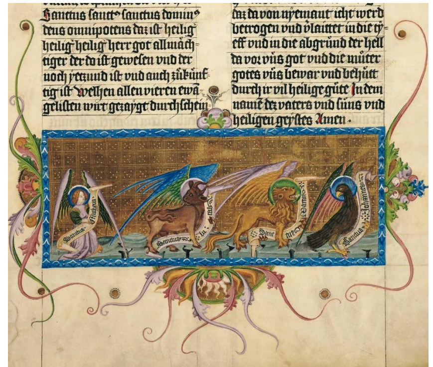
Ottheinrich Bible 1430 (I: 14) The Four Gospels in The Prologue

Trinity Lutheran Church 1000 North Park Avenue, Herrin, IL 62948 (618) 942-3401 www.trinityh.org