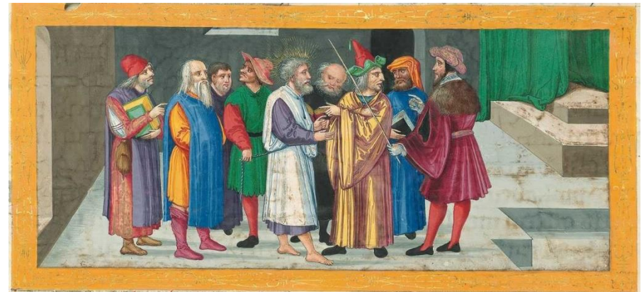
Ottheinrich Bible 1430 (VII:36)

Lord, we beseech Thee, grant Thy people grace to withstand the temptations of the devil and with pure hearts and minds to follow Thee, the Only God; through Jesus Christ, Thy Son, our Lord, Who liveth and reigneth with Thee, and the Holy Ghost, ever one God, world without end. Amen.