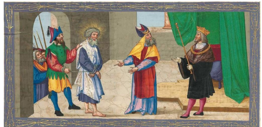
Ottheinrich Bible 1430 (VII:43)

WE give thanks unto Thee, O God, even we who are sunken in so many sins and have found no health and comfort save that which is with Thee only: We humbly beseech Thee that Thou wilt not turn from us, though it be but our just desert, the light of Thy countenance, but according to Thy great mercy increase in us continually that which Thou hast already begun; through Jesus Christ, Thy Son, our Lord, who livest and reignest with the Father and the Holy Ghost, ever one God, world without end. Amen. (Oremus, 1925, p.149).