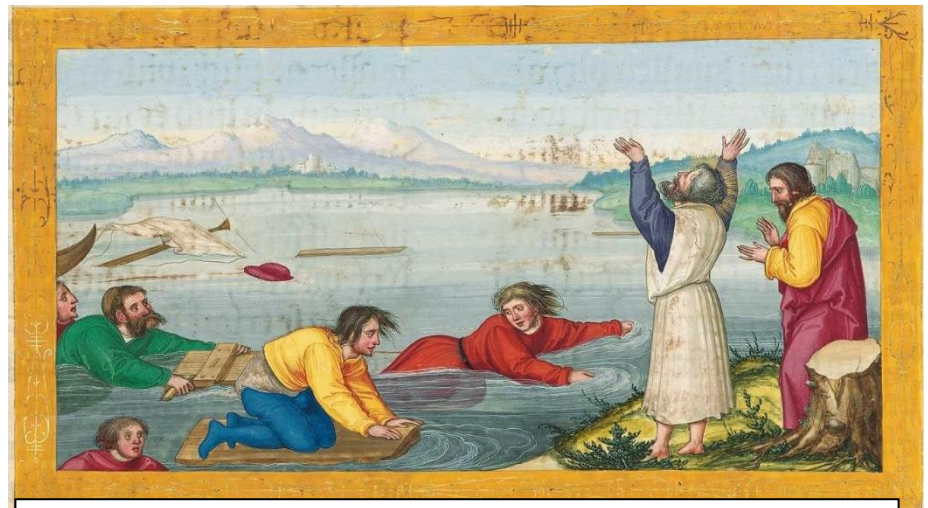
Ottheinrich Bible 1430 (VII:49)

FORGIVE for Christ's sake, O merciful Father, the imperfections of this service, and grant that our lives may show forth Thy praise. Amen. (Oremus, 1925, p.154).