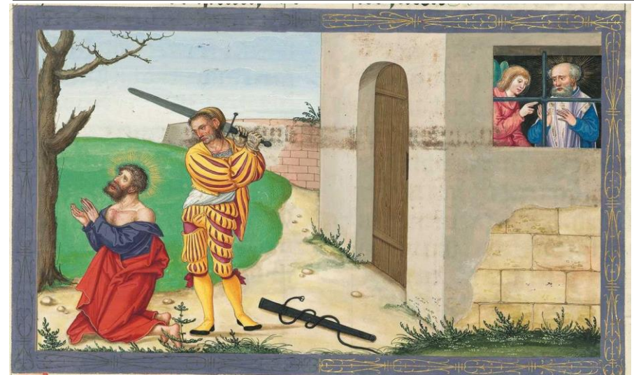
Ottheinrich Bible 1430 (VII:8)

THE GOD of our Lord Jesus Christ, and through Him, the Father of us all, grant that His godly name be hallowed, His kingdom increased, His divine will accomplished and that all that would hinder this be entirely done away, to the end, that we, in righteous Christian faith and with the fruits of good works, may live, glorify and praise Him, together with the Son and the Holy Ghost, the one, eternal, true God; for His is the kingdom, and the power, and the glory in eternity Amen. (Oremus, 1925, p.127-128).