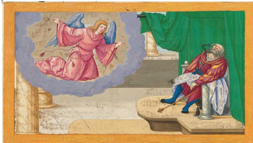
Ottheinrich Bible 1430 (VII:9)

LORD and Giver of Life, Supplier of good things, Thou Who didst give to men the blessed hope of everlasting life, our Lord Jesus Christ: Vouchsafe that we may in holiness accomplish this divine liturgy to Thee, to the enjoyment of future blessedness; to the end that we, ever guarded by Thy might and conducted to the light of truth, may send up to Thee glory and thanksgiving, Father, Son and Holy Ghost, now and ever; Amen. (Oremus, 1925, p.128).