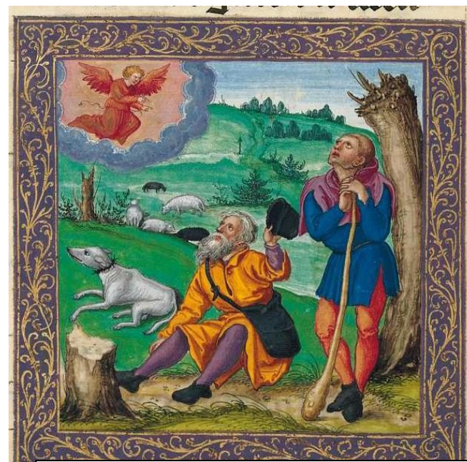
Ottheinrich Bible 1430 (II:66) Angels Appear to the Shepherds in Luke 2:1-20

Grant, we implore You, almighty God, that we, upon whom is poured the new light of Thy Word made flesh, may show forth in our actions that which by faith shineth in our minds; through the same Jesus Christ, Your Son, Your Son, our Lord, who lives and reigns with You and the Holy Spirit, one God, now and forever. AMEN