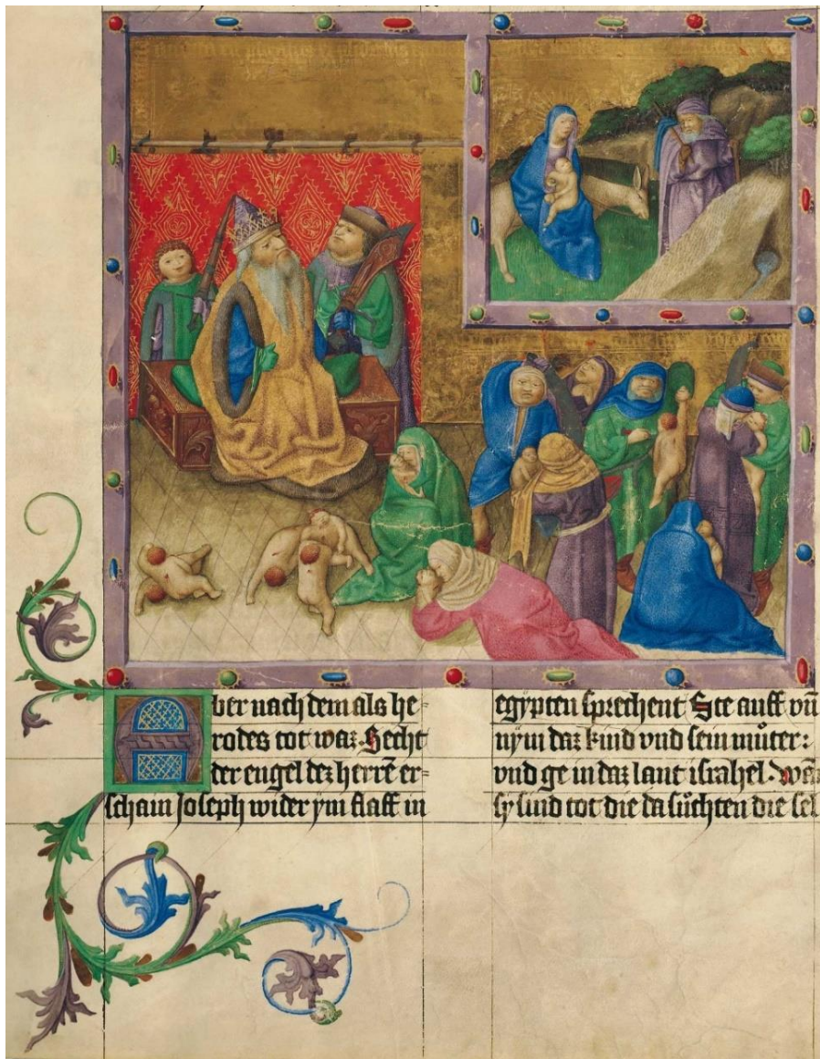
Ottheinrich Bible 1430 (I:24) Herod Slaughters the Bethlehem Babies in Matthew 2