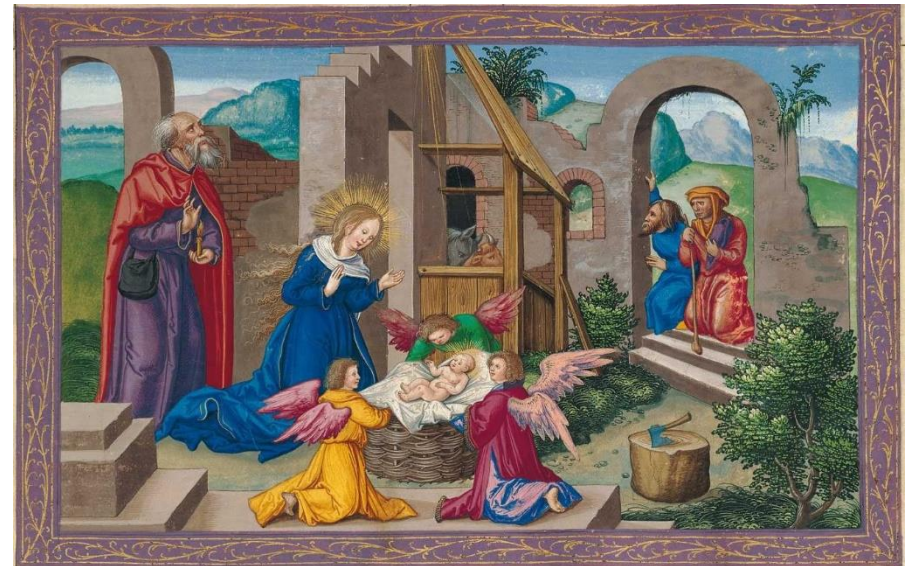
Ottheinrich Bible 1430 (II:67a) Jesus Lying in a Manger in Luke 2