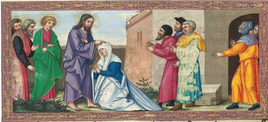
Ottheinrich Bible 1430 (III:30) Woman Healed on the Sabbath in Luek 13:10-17

Almighty and everlasting God, mercifully look upon our infirmities and in all our dangers and necessities stretch forth the right hand of Your majesty to help and defend us; through Jesus Christ, Your Son, our Lord, who lives and reigns with the Father and the Holy Spirit, one God, now and forever. Amen.