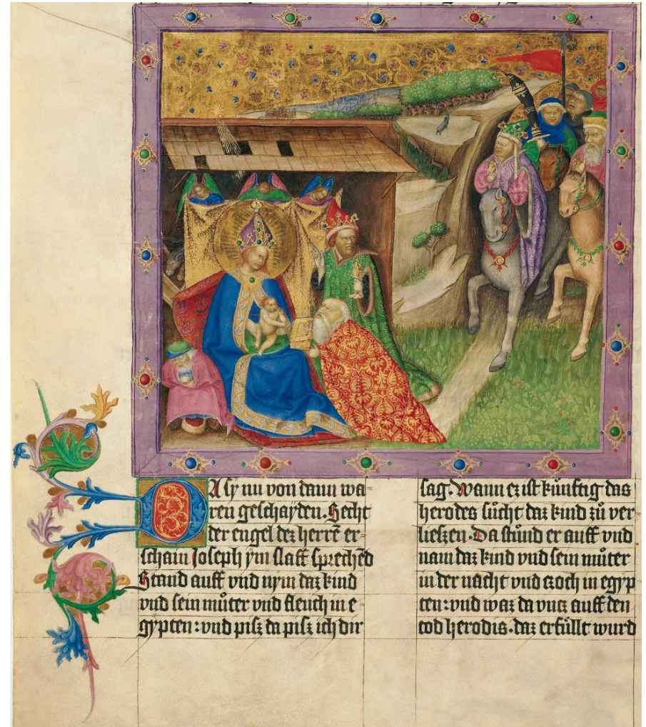
Ottheinrich Bible 1430 (I:23) The Wise Men Visit the Baby Jesus in Matthew 2

O God, Who by the leading of a star didst manifest Thine Only-Begotten Son to the Gentiles, mercifully grant that we, who know Thee now by faith, may after this life have the fruition of Thy glorious Godhead; through the same Jesus Christ, Thy Son, our Lord, Who liveth and reigneth with Thee and the Holy Ghost, ever one God, world without end. Amen.