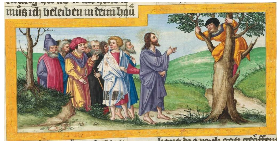
Ottheinrich Bible 1430 (III:46) Zachaeus in Luke 19:1-10