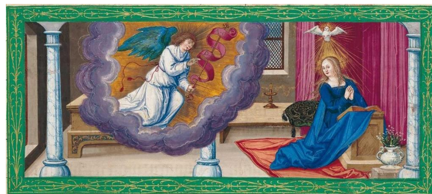
Ottheinrich Bible 1430 (II:63) The Annunciation of Gabriel to the Blessed Virgin Mary in Luke 1