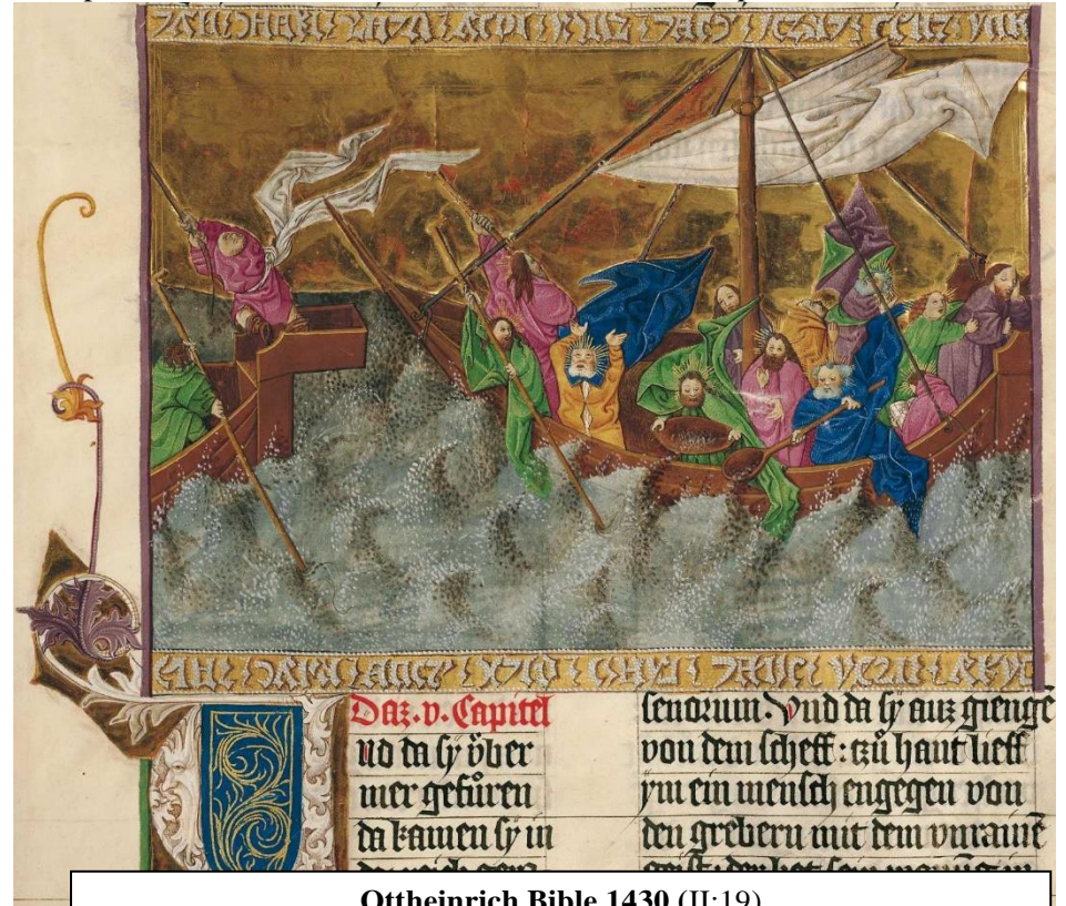
Ottheinrich Bible 1430 (II:19) The Wind and the Waves Obey Jesus in Mark 4

Grant, I ask, to Your ministers the necessary knowledge and pious diligence in all doings, that they first learn from You before presuming to teach others [Jas. 3:1]. Govern and enlighten their hearts by Your Spirit so that in the place of God they preach nothing other than God’s Word; they shepherd the flock committed unto them [1 Pet. 5:2], purchased and