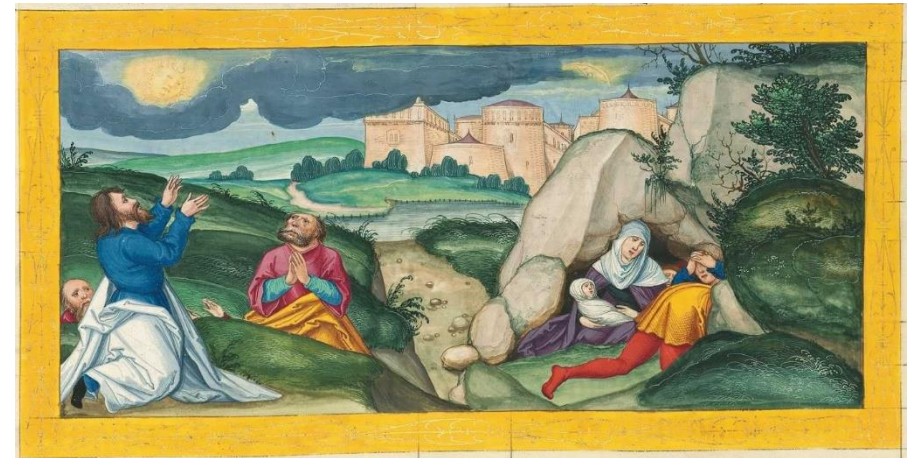
Ottheinrich Bible 1430 (III:54) Signs at the End – Nursing Mothers in the Rocks - Luke 21:5-24

Stir up our hearts, O Lord, to make ready the way of Thine Only-Begotten Son, so that by His coming we may be enabled to serve Thee with pure minds; through the same Jesus Christ, Thy Son, our Lord, Who liveth and reigneth with Thee and the Holy Ghost, ever one God, world without end. Amen.