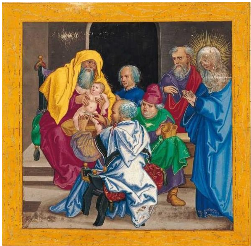
Ottheinrich Bible 1430 (II:67b) Circumcision of Jesus in Luke 2:21