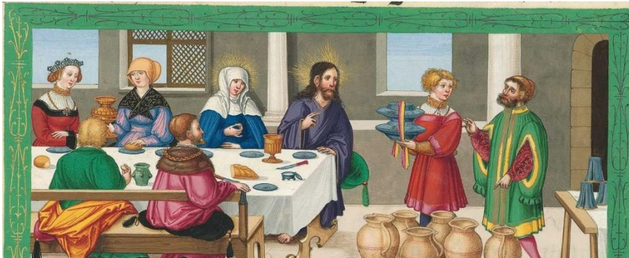
Ottheinrich Bible 1430 (III:74) Jesus Turns Water into Wine in John 2:1-11

Almighty and Everlasting God, Who dost govern all things in Heaven and Earth, mercifully hear the supplications of Thy people and grant us Thy peace all the days of our life; through Jesus Christ, Thy Son, our Lord, Who liveth and reigneth with Thee and the Holy Ghost, ever one God, world without end. Amen.