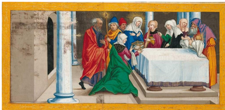
Ottheinrich Bible 1430 (II:68)

Almighty and Everlasting God, direct our actions according to Thy good pleasure, that in the name of Thy beloved Son we may be made to abound in good works; through the same Jesus Christ, Thy Son, our Lord, Who liveth and reigneth with Thee and the Holy Ghost, ever one God, world without end. AMEN