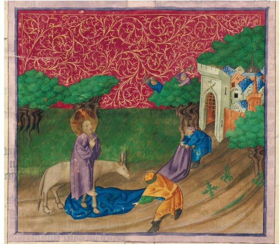
Ottheinrich Bible 1430 (I:65) Palm Sunday Procession in Matthew 21:1-9

Catechism - The Lord's Prayer, The Sixth Petition