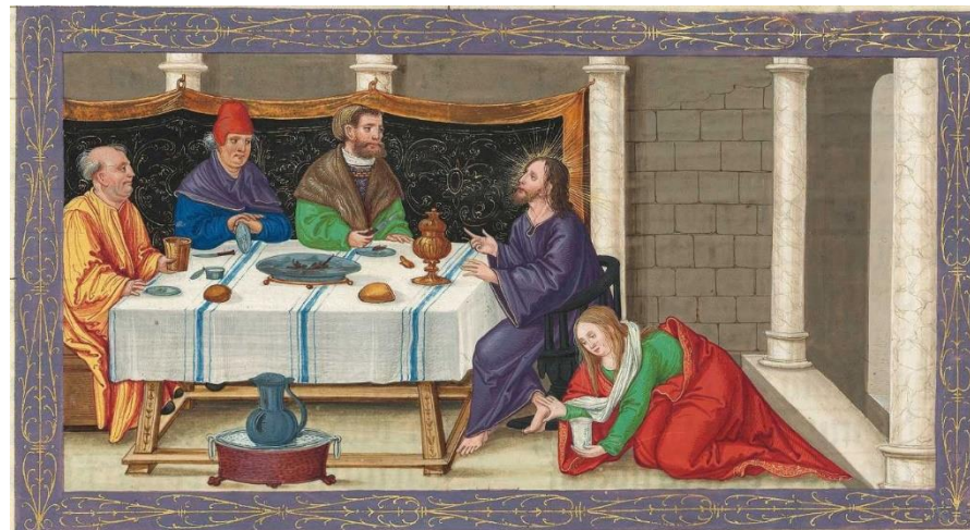
Ottheinrich Bible 1430 (III:10) Woman Anoints Jesus in Luke 7:36-50

Catechism - The Sacrament of Holy Baptism, Fourth Question