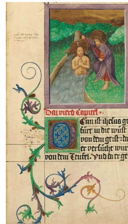
Ottheinrich Bible 1430 (I:26) Baptism of Jesus in Matthew 4

Christmas Eve and Day: December 24-25, 2024