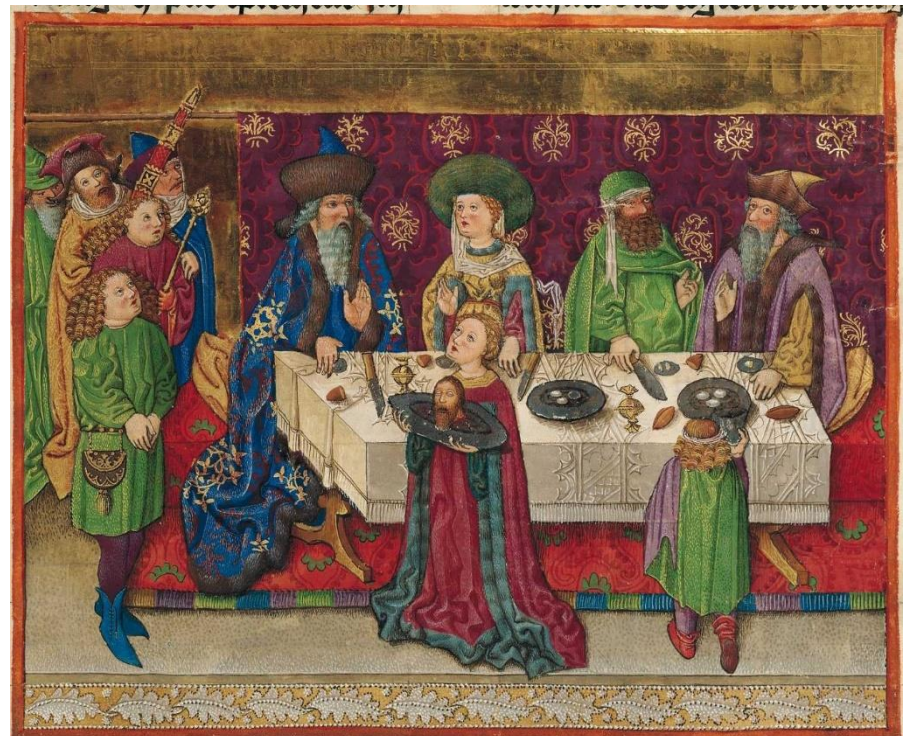
Ottheinrich Bible 1430 (II:25) John the Baptist's Head on a platter in Mark 6:15-29