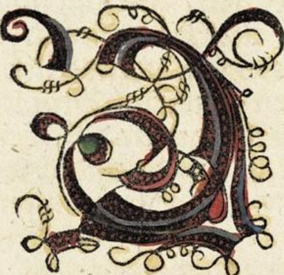
Psalm 132—Memento, Domine