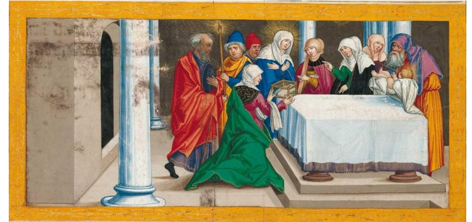
Ottheinrich Bible 1430 (II:68) Presentation of Jesus at the Temple in Luke 2