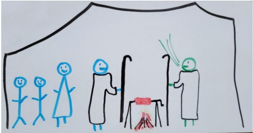
Lord had delivered them.

7 So Moses went out to meet his father-in-law, bowed down, and kissed him. And they asked each other about their well-being, and they went into the tent. 8 And Moses told his father-in-law all that the Lord had done to Pharaoh and to the Egyptians for Israel's sake, all the hardship that had come upon them on the way, and how the