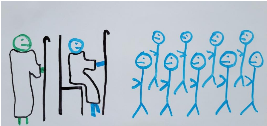
people? Why do you alone sit, and all the people stand before you from morning until evening?"

Genesis 31:54, "Then Jacob offered a sacrifice on the mountain, and called his brethren to eat bread . And they ate bread and stayed all night on the mountain."