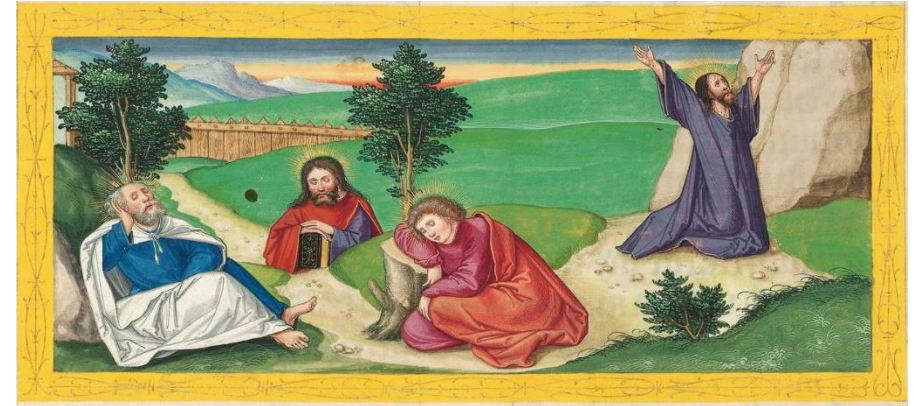
Ottheinrich Bible 1430 (III:58a) Jesus Prays on the Mount of Olives Luke 22:39-46