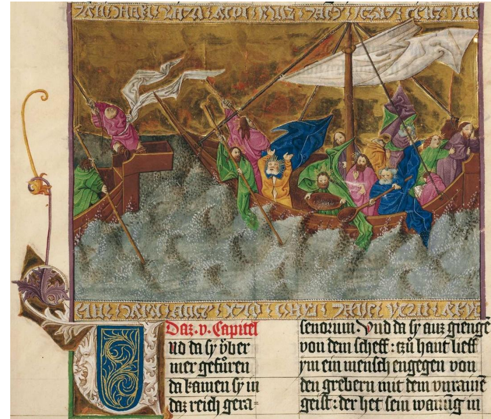
Ottheinrich Bible 1430 (II:19) The Wind and the Waves Obey Jesus in Mark 4