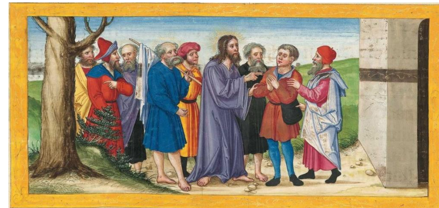
Ottheinrich Bible 1430 (III:45) Blind Bartimaeus in Luke 18:35-43

In the back of the present edition of The Our Family Daily Prayers are morning and evening prayers for each day of the week.