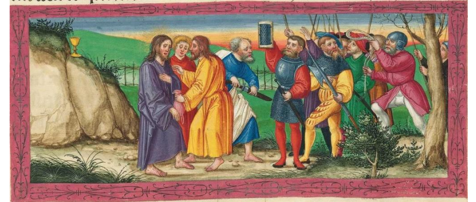
Ottheinrich Bible 1430 (III:58b) Jesus Arrested in Luke 22:47-53