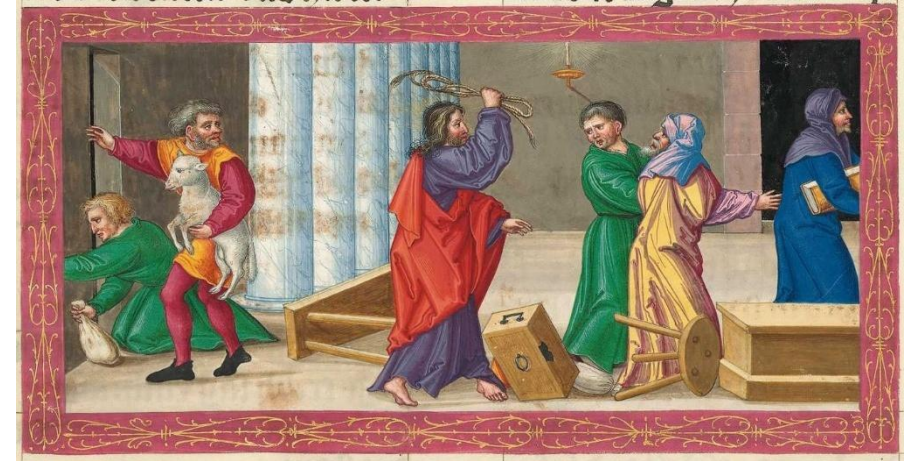
Ottheinrich Bible 1430 (III:49b) Jesus in the Temple in Luke 19:45-48