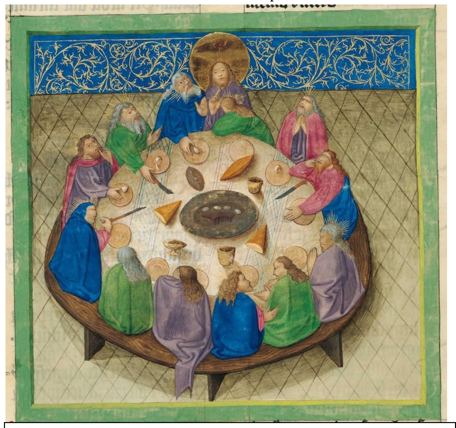
Ottheinrich Bible 1430 (I:81) Lord's Supper

Catechism - Table of Duties: Children: Eph 6:1-3