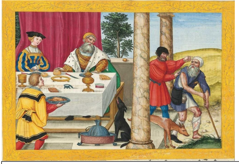
Ottheinrich Bible 1430 (III:40) The Rich Man & Lazarus Luke 16:19-31

redeemed by the passion and death of God. Why then should we stoop to love the creature? Would not that be inconsistent with the dignity to which God has exalted the human soul? Whatever we love, we love because of its power, its wisdom, or its beauty. Now what is more powerful, what is wiser, what is more beautiful, than God? All the power of earthly monarchs is from Him and is subject to Him; all human wisdom, compared with the divine, is foolishness; all creature beauty in comparison with God's is absolute deformity. (Gerhard's Sacred Meditations – IX: Loving God Alone, Repristination Press, p. 49-50)