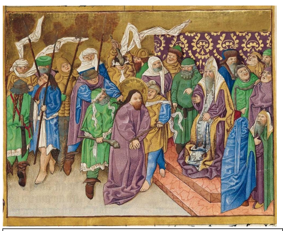
Ottheinrich Bible 1430 (II:5) Jesus is Sentenced

<u>To Workers of All Kinds:</u> Eph. 6:5–8 To Employers and Supervisors: Eph. 6:9