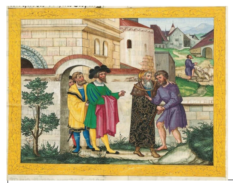
Ottheinrich Bible 1430 (III:37) The Lost Son Luke 15:11-32

O God, the Protector of all that trust in Thee, without Whom nothing is strong, nothing is holy, increase and multiply upon us Thy mercy that, Thou being our Ruler and Guide, we may so pass through things temporal that we finally lose not the things eternal; through Jesus Christ, Thy Son, our Lord, Who liveth and reigneth with Thee, and the Holy Ghost, ever one God, world without end. Amen.