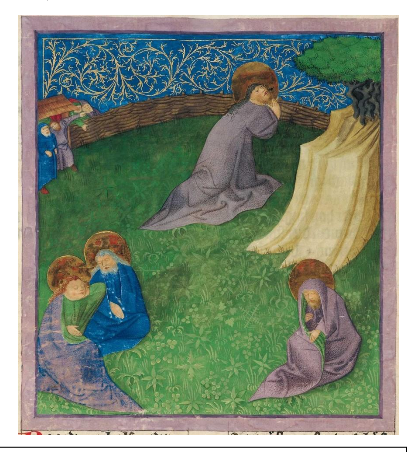
Ottheinrich Bible 1430 (II:2) The Lord Praying in the Garden

took upon Himself the direst poverty; for He had not where to lay His head (Matt. viii. 20). That He might make us the sons of God, He became a man; and the work of redemption being finished, He does not now neglect us, but sitting at the right hand of the Divine Majesty, He there maketh intercession for us (Rom. viii. 34). What that is necessary to my salvation will He not accomplish for me, since He hath devoted Himself to the work of my eternal salvation? What will the Father deny the Son, who became obedient to Him unto death, even the death of the cross (Phil. ii. 8)? What will the Father deny the Son, since He hath already accepted the ransom offered by the Son? (Gerhard's Sacred Meditations – VIII: The Certainty of Our Salvation, Repristination Press, p. 46-47)