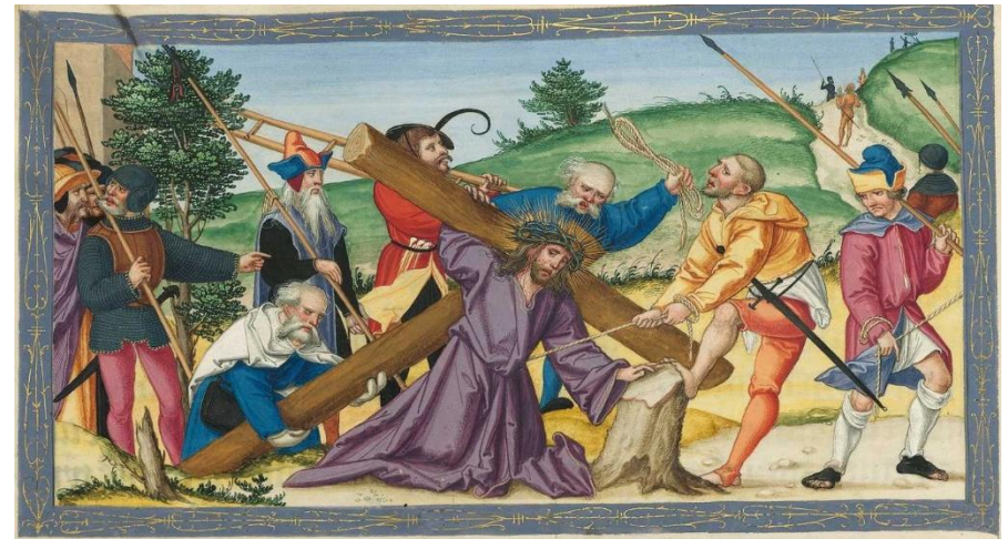
Ottheinrich Bible 1430 (III:63b)

O God, so rule and govern our hearts and minds by Thy Holy Spirit that, being ever mindful of the end of all things and the day of Thy just judgment, we may be stirred up to holiness of living here and dwell with Thee forever hereafter; through Jesus Christ, Thy Son, our Lord, Who liveth and reigneth with Thee and the Holy Ghost, ever one God, world without end. Amen.