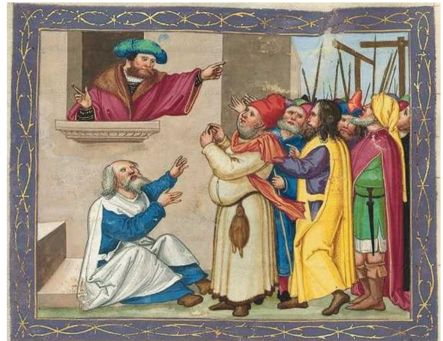
Ottheinrich Bible 1430 (III:62b)

Almighty God, we beseech Thee, show Thy mercy unto Thy humble servants, that we who put no trust in our own merits may not be dealt with after the severity of Thy judgment, but according to Thy mercy; through Jesus Christ, Thy Son, our Lord, Who liveth and reigneth with Thee and the Holy Ghost, ever one God, world without end. Amen.