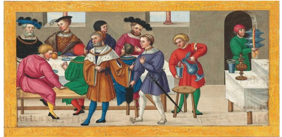
Ottheinrich Bible 1430 (III:32)

Lord, we beseech Thee, grant Thy people grace to withstand the temptations of the devil and with pure hearts and minds to follow Thee, the Only God; through Jesus Christ, Thy Son, our Lord, Who liveth and reigneth with Thee, and the Holy Ghost, ever one God, world without end. Amen.