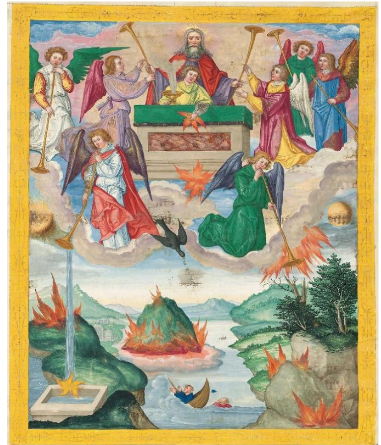
Ottheinrich Bible 1430 (VIII: 26) Trumpets Around the Throne in Revelation 8

Trinity Lutheran Church 1000 North Park Avenue, Herrin, IL 62948 (618) 942-3401 www.trinityh.org