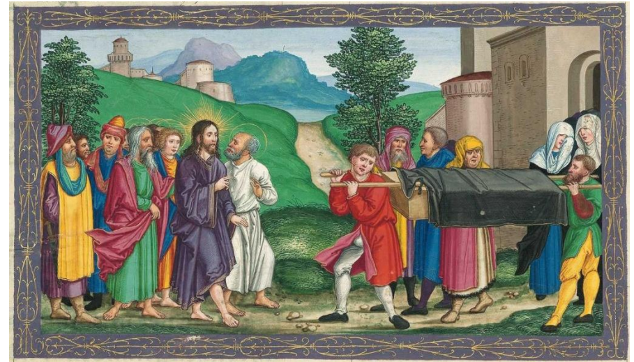
Ottheinrich Bible 1430 (III:7) Jesus Raises the Widow's Son in Luke 7:11-17

Lord, we pray Thee that Thy grace may always go before and follow after us and make us continually given to all good works; through Jesus Christ, Thy Son, our Lord, Who liveth and reigneth with Thee and Holy Ghost, ever one God, world without end. Amen.