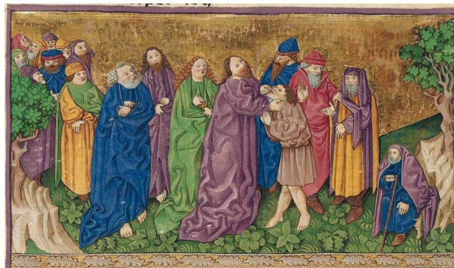
Ottheinrich Bible 1430 (II:30) Feeding the Four Thousand Mk 8:1-10