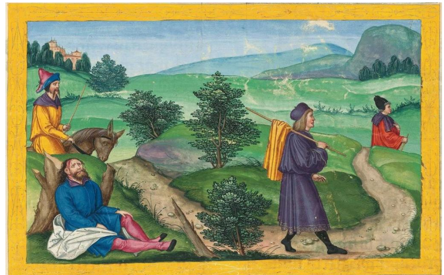
Ottheinrich Bible 1430 (III:20)

Almighty and Everlasting God, give unto us the increase of faith, hope, and charity, and that we may obtain that which Thou dost promise, make us to love that which Thou dost command; through Jesus Christ, Thy Son, our Lord, Who liveth and reigneth with Thee and the Holy Ghost, ever one God, world without end. Amen.