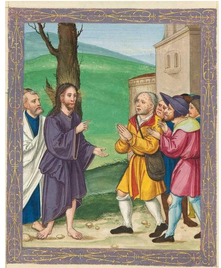
Ottheinrich Bible 1430 (VII:25)

Catechism - The Ten Commandments: The 9 th and 10 th Commandments