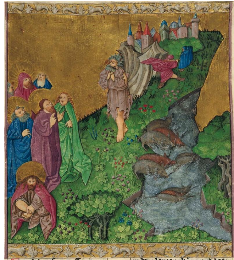
Ottheinrich Bible 1430 (II:21)

Grant, we beseech Thee, merciful Lord, to Thy faithful people pardon and peace, that they may be cleansed from all their sins and serve Thee with a quiet mind; through Jesus Christ, Thy Son, our Lord, Who liveth and reigneth with Thee and the Holy Ghost, ever one God, world without end. Amen.