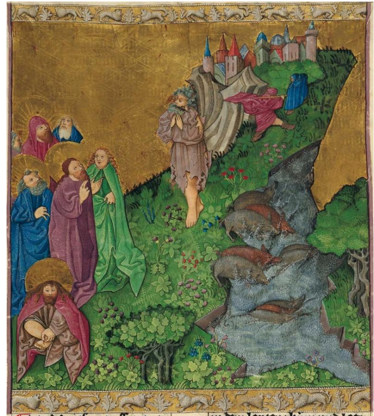
Ottheinrich Bible 1430 (II:21)

Grant, we beseech Thee, merciful Lord, to Thy faithful people pardon and peace, that they may be cleansed from all their sins and serve Thee with a quiet mind; through Jesus Christ, Thy Son, our Lord, Who liveth and reigneth with Thee and the Holy Ghost, ever one God, world without end. Amen.