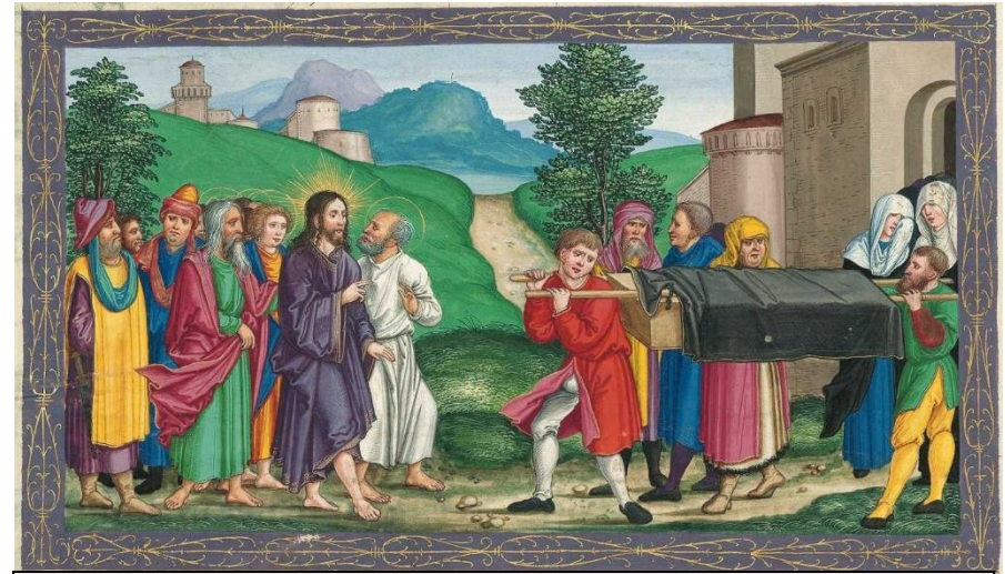
Ottheinrich Bible 1430 (III:7) Jesus Raises the Widow's Son in Luke 7:11-17

Lord, we pray Thee that Thy grace may always go before and follow after us and make us continually given to all good works; through Jesus Christ, Thy Son, our Lord, Who liveth and reigneth with Thee and Holy Ghost, ever one God, world without end. Amen.