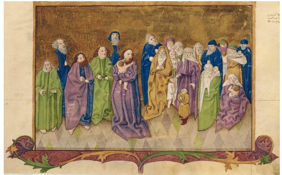
Ottheinrich Bible 1430 (II:37)

Almighty and Merciful God, of Whose only gift it cometh that Thy faithful people do unto Thee true and laudable service, grant, we beseech Thee, that we may so faithfully serve Thee in this life that we fail not finally to attain Thy heavenly promises; through Jesus Christ, Thy Son, our Lord, Who liveth and reigneth with Thee and the Holy Ghost, ever one God, world without end. Amen.