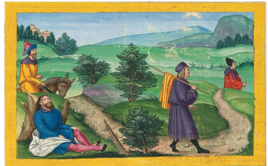
Ottheinrich Bible 1430 (III:20)

Almighty and Everlasting God, give unto us the increase of faith, hope, and charity, and that we may obtain that which Thou dost promise, make us to love that which Thou dost command; through Jesus Christ, Thy Son, our Lord, Who liveth and reigneth with Thee and the Holy Ghost, ever one God, world without end. Amen.