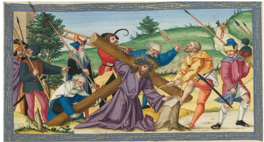
Ottheinrich Bible 1430 (III:63b)

O God, so rule and govern our hearts and minds by Thy Holy Spirit that, being ever mindful of the end of all things and the day of Thy just judgment, we may be stirred up to holiness of living here and dwell with Thee forever hereafter; through Jesus Christ, Thy Son, our Lord, Who liveth and reigneth with Thee and the Holy Ghost, ever one God, world without end. Amen.