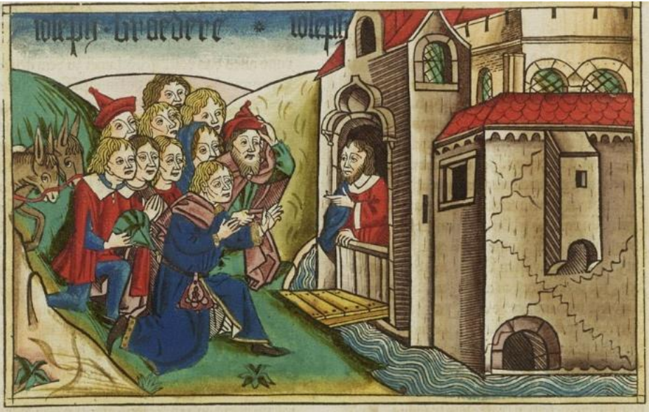
Illustrated German Bible of 1483 (I:52, Genesis 42) Joseph's Brothers Come to Egypt