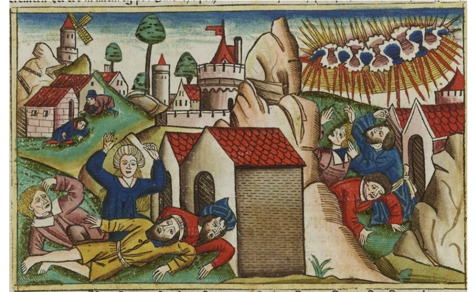
Illustrated German Bible of 1483 (I:74 Exodus 10-11) The Plague of Darkness