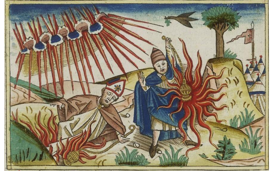
Illustrated German Bible of 1483 (I:114 Leviticus 10) Unauthorized Fire