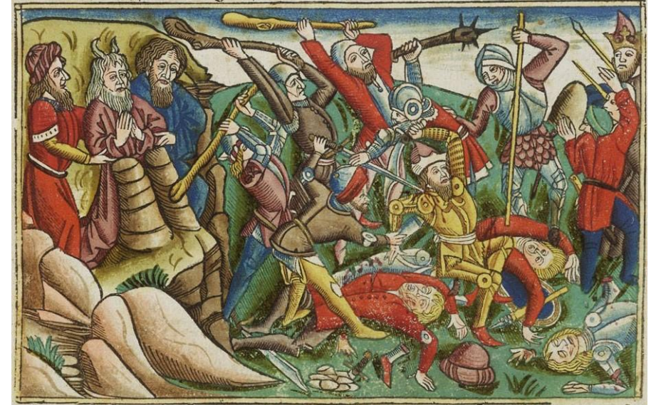
Illustrated German Bible of 1483 (I:83 Exodus 17:8-16) Victory over the Amalkites