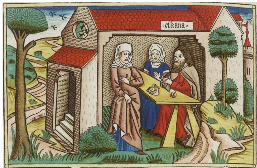
Illustrated German Bible of 1483 (I:252 1 Samuel 1) Elkanah's Home