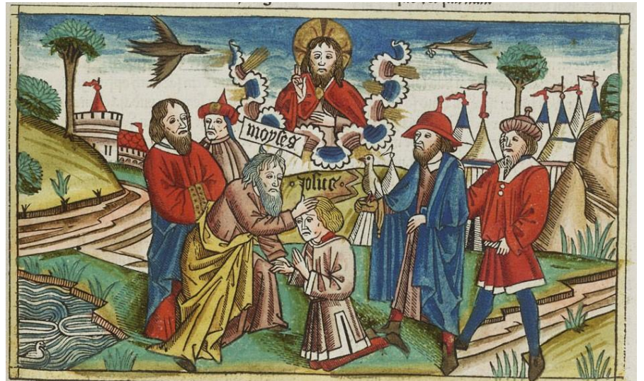
Illustrated German Bible of 1483 (I:161 Leviticus 27) Moses Redeems a Person