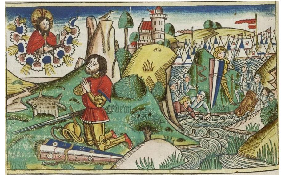
Illustrated German Bible of 1483 (I:228 Judges 6) Gideon and men lapping water