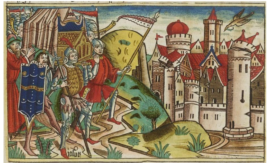
Illustrated German Bible of 1483 (I:205 Joshua 3-4) The Walls of Jericho

Grant to us, Lord, we beseech Thee, the Spirit to think and do always such things as are right, that we, who cannot do anything that is good without Thee, may by Thee be enabled to live according to Thy will; through Jesus Christ, Thy Son, our Lord, Who liveth and reigneth with Thee and the Holy Ghost, ever one God, world without end. Amen.