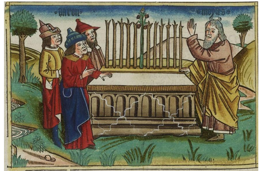
Illustrated German Bible of 1483 (I:150 Leviticus 17) Aaron's Staff Buds

Grant, O Lord, we beseech Thee, that the course of this world may be so peaceably ordered by Thy governance, that Thy Church may joyfully serve Thee in all godly quietness; through Jesus Christ, Thy Son, our Lord, Who liveth and reigneth with Thee, and the Holy Ghost, ever one God, world without end. Amen.