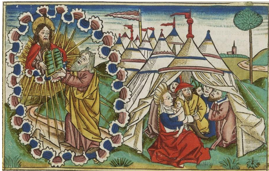
Illustrated German Bible of 1483 (I:85 Exodus 20) Ten Commandments and People in Tents