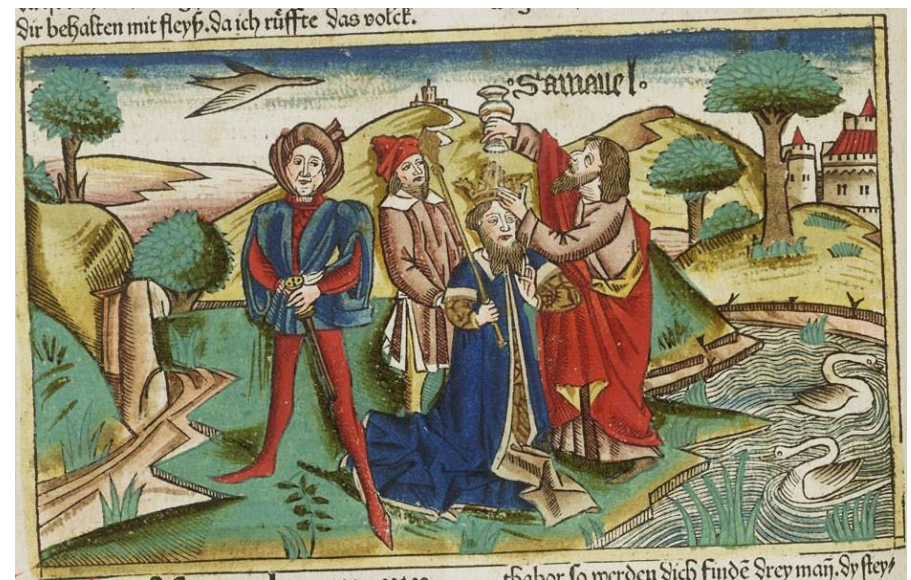
Illustrated German Bible of 1483 (I:260 1 Samuel 10) The King is Anointed