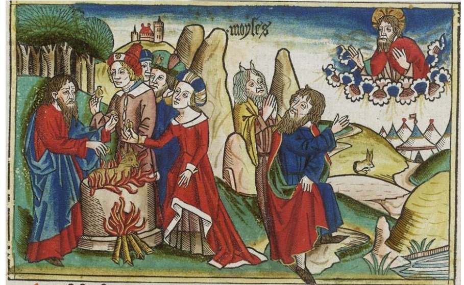
Illustrated German Bible of 1483 (I:97 Exodus 32) The Golden Calf and Moses/Aaron with God