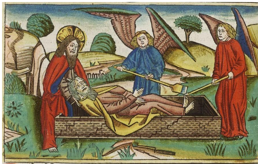
Illustrated German Bible of 1483 (I:200 Deuteronomy 24) Moses Dies

O God, Whose never-failing providence ordereth all things both in Heaven and Earth, we humbly beseech Thee to put away from us all hurtful things and give to us those things which be profitable for us; through Jesus Christ, Thy Son, our Lord, Who liveth and reigneth with Thee and the Holy Ghost, ever one God, world without end. AMEN