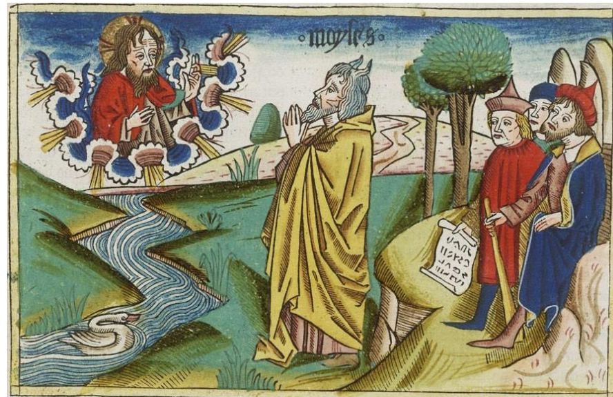
Illustrated German Bible of 1483 (I:107 Leviticus 1) God Speaks to Moses, Aaron and his Sons

Although reason may, to some extent enable us, by its innate light, to lead an honest life, and to perform the external works of the law, without Christ and the Holy Spirit, yet it is true, as we stated above, the principal parts of the divine law, that is, turning the whole heart to God, and reverencing him sincerely, (as required in the first