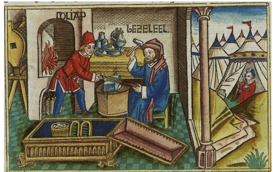
Illustrated German Bible of 1483 (I:96 Exodus 31, 35:30-35) The Artisans: Bezaleel and Aholiab

Wherefore, our adversaries do us wrong, in charging us with being silent on the subject of good works ; while we not only assert, that men must do good works, but also in particular point out, that the heart must be engaged therein, if they are not in vain, empty, cold, hypocritical works. Experience teaches, that although the hypocrites undertake to keep the law by their own strength, they are unable to do so, or to prove it by their deeds. For to what extent are they free from hatred, from envy, contention, rage, anger, avarice, adultery, &c.? Can greater vices be found any where, than in monasteries? Human nature is much too weak, by its own strength, to resist the devil, his artifices and power ; for he holds all those captive, who are not redeemed by Christ. Divine strength and the resurrection of Christ are necessary to overcome the devil. And since we know that we become participants of Christ’s strength and victory through faith, we can pray God, upon the promise given, to protect and govern us