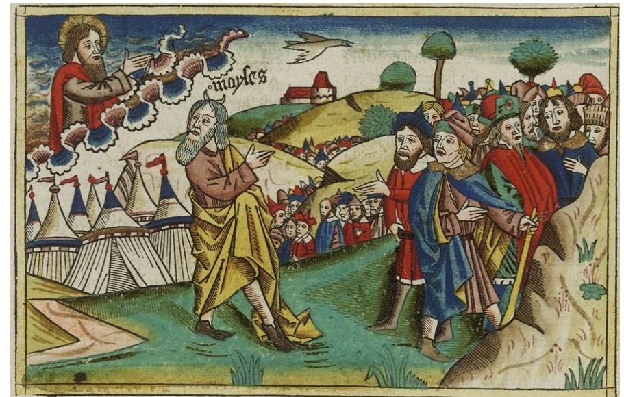
Illustrated German Bible of 1483 (I:132 Numbers 1)

Almighty and Everlasting God, Who hast given unto us, Thy servants, grace, by the confession of a true faith, to acknowledge the glory of the Eternal Trinity and in the power of the Divine Majesty to worship the Unity, we beseech Thee that Thou wouldst keep us steadfast in this faith and evermore defend us from all adversities; Who livest and reignest, Father, Son, and Holy Ghost, ever one God, world without end. Amen.