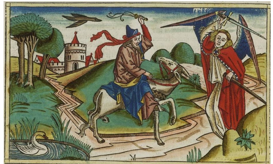
Illustrated German Bible of 1483 (I:156 Numbers 21-22) Balaam's Prophecy and the Donkey

Lord of All Power and Might, Who art the Author and Giver of all good things, graft in our hearts the love of Thy Name, increase in us true religion, nourish us with all godness, and of Thy great mercy keep us in the same; through Jesus Christ, Thy Son, our Lord, Who liveth and reigneth with Thee, and the Holy Ghost, ever one God, world without end. Amen.