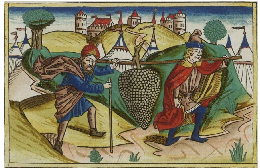
Illustrated German Bible of 1483 (I:146 Numbers 13) Grapes on a Pole from the Promised Land

O Lord, Who never failest to help and govern those whom Thou dost bring up in Thy steadfast fear and love, make us to have a perpetual fear and love of Thy holy Name; through Jesus Christ, Thy Son, our Lord, Who liveth and reigneth with Thee, and the Holy Ghost, ever one God, world without end. Amen.