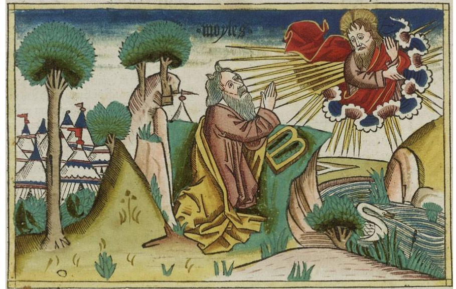
Illustrated German Bible of 1483 (I:100 Exodus 34) The New Tablets of Stone

Catechism - Table of Duties: Children: Eph 6:1-3