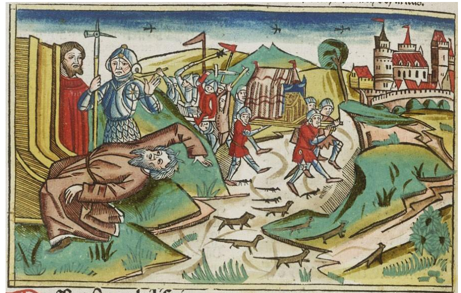
Illustrated German Bible of 1483 (I:256 1 Samuel 5) Ark Captured and Rat Infestation

O God, Who declarest Thine almighty power chiefly in showing mercy and pity, mercifully grant unto us such a measure of Thy grace that we, running the way of Thy Commandments, may obtain Thy gracious promises and be made partakers of Thy heavenly treasure; through Jesus Christ, Thy Son, our Lord, Who liveth and reigneth with Thee and the Holy Ghost, ever one God, world without end. Amen.