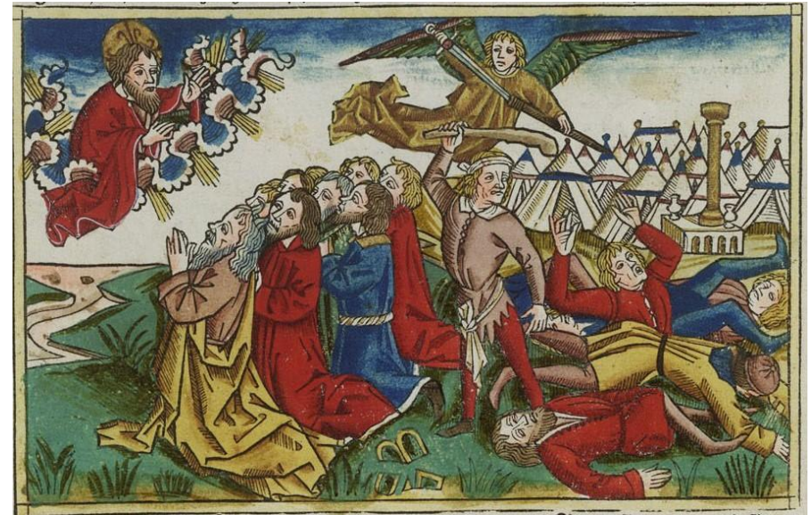
Illustrated German Bible of 1483 (I:98 Exodus 32:35) The Anger of God