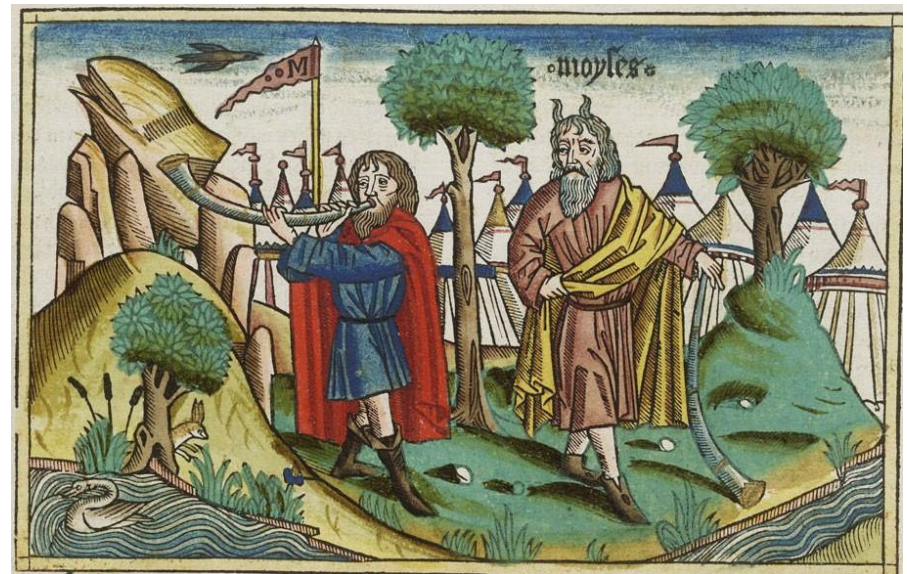
Illustrated German Bible of 1483 (I:143 Numbers 10) The Trumpet when Departing Camp

O God, the Strength of all them that put their trust in Thee, mercifully accept our prayers; and because through the weakness of our mortal nature we can do no good thing without Thee, grant us the help of Thy grace that in keeping Thy Commandments we may please Thee both in will and deed; through Jesus Christ, Thy Son, our Lord, Who liveth and reigneth with Thee, and the Holy Ghost, ever one God, world without end. Amen.