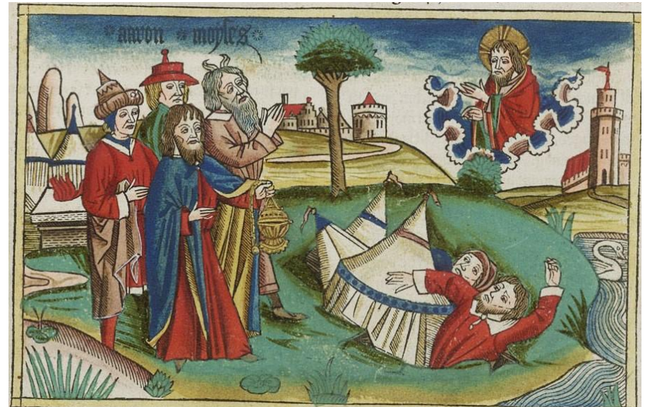
Illustrated German Bible of 1483 (I:149 Leviticus 16) The Earth Swallows up the Impenitent

O God, the Protector of all that trust in Thee, without Whom nothing is strong, nothing is holy, increase and multiply upon us Thy mercy that, Thou being our Ruler and Guide, we may so pass through things temporal that we finally lose not the things eternal; through Jesus Christ, Thy Son, our Lord, Who liveth and reigneth with Thee, and the Holy Ghost, ever one God, world without end. Amen.