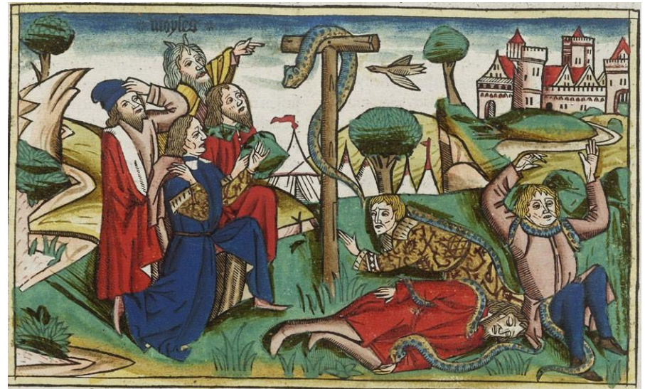
Illustrated German Bible of 1483 (I:155 Numbers 21) Bronze Serpent on a Pole

O God, Who hast prepared for them that love Thee such good things as pass man’s understanding, pour into our hearts such love toward Thee that we, loving Thee above all things, may obtain Thy promises, which exceed all that we can desire; through Jesus Christ, Thy Son, our Lord, Who liveth and reigneth with Thee, and the Holy Ghost, ever one God, world without end. Amen.