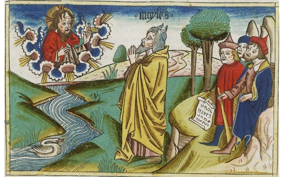
Illustrated German Bible of 1483 (I:107 Leviticus 1) God Speaks to Moses, Aaron and his Sons