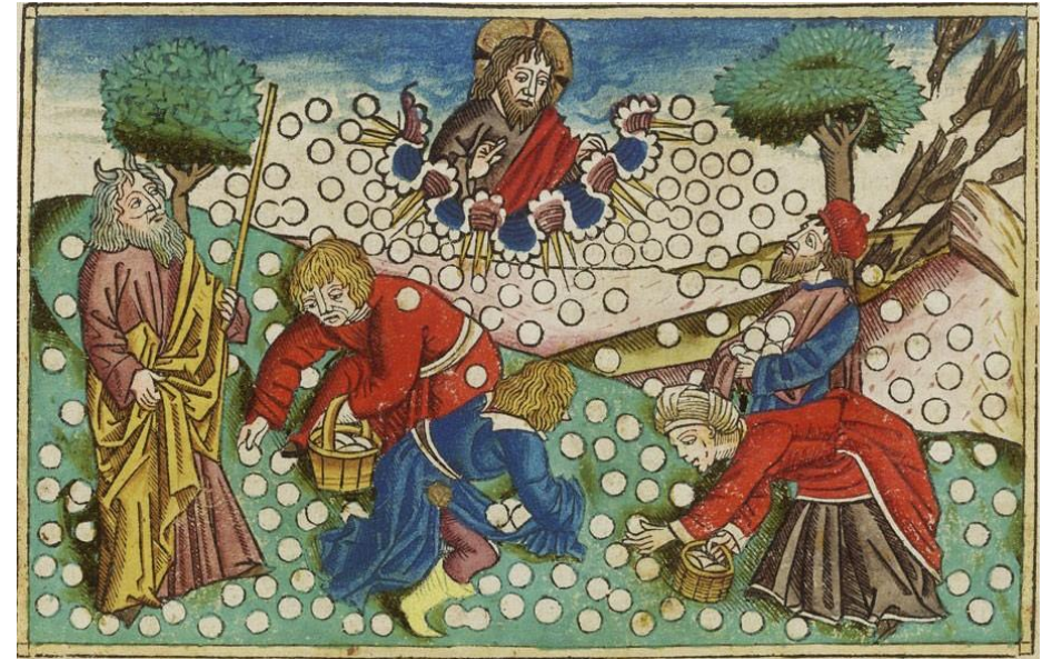
Illustrated German Bible of 1483 (I:81 Exodus 16) Manna from Heaven