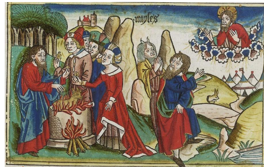
Illustrated German Bible of 1483 (I:97 Exodus 32) The Golden Calf and Moses/Aaron with God