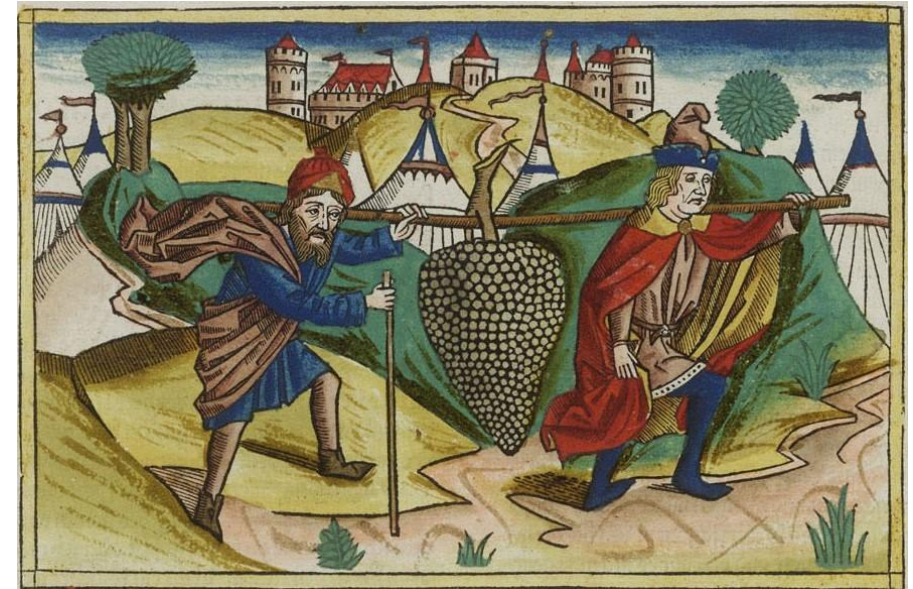
Illustrated German Bible of 1483 (I:146 Numbers 13) Grapes on a Pole from the Promised Land