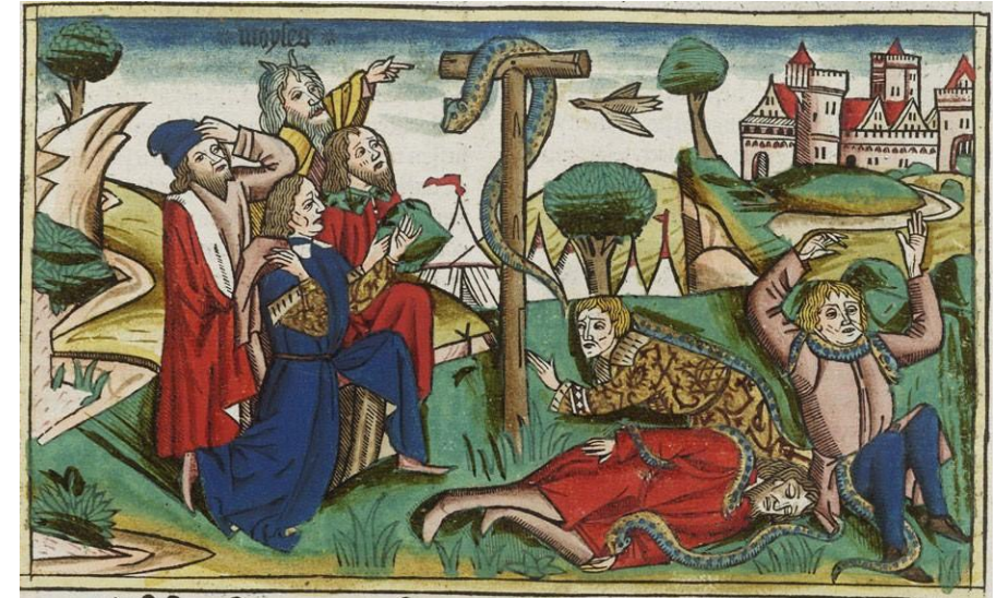
Illustrated German Bible of 1483 (I:155 Numbers 21) Bronze Serpent on a Pole