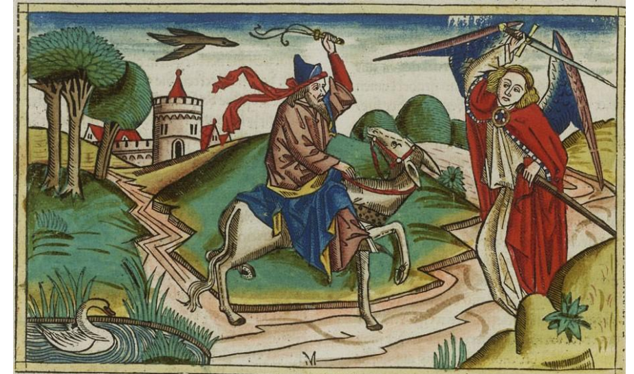
Illustrated German Bible of 1483 (I:156 Numbers 21-22) Balaam’s Prophecy and the Donkey